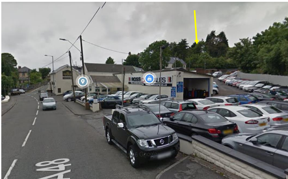
Position of oak tree and visibility from Bolgoed Road.